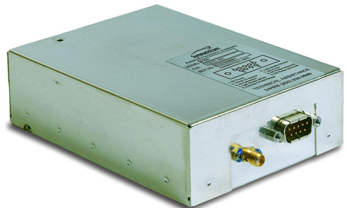
8100 Ruggedized Rubidium Oscillator

Suitable applications include shipboard, airborne, navigation timing, range timing and other tactical applications that need the performance level associated with rubidium technology in a commercial off the shelf (COTS) package.